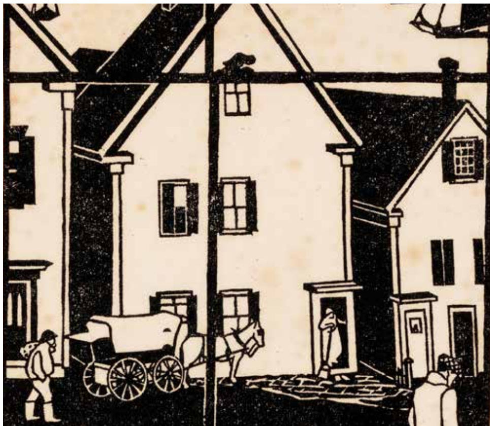
Detail from untitled (view through a window) by Mildred McMillen