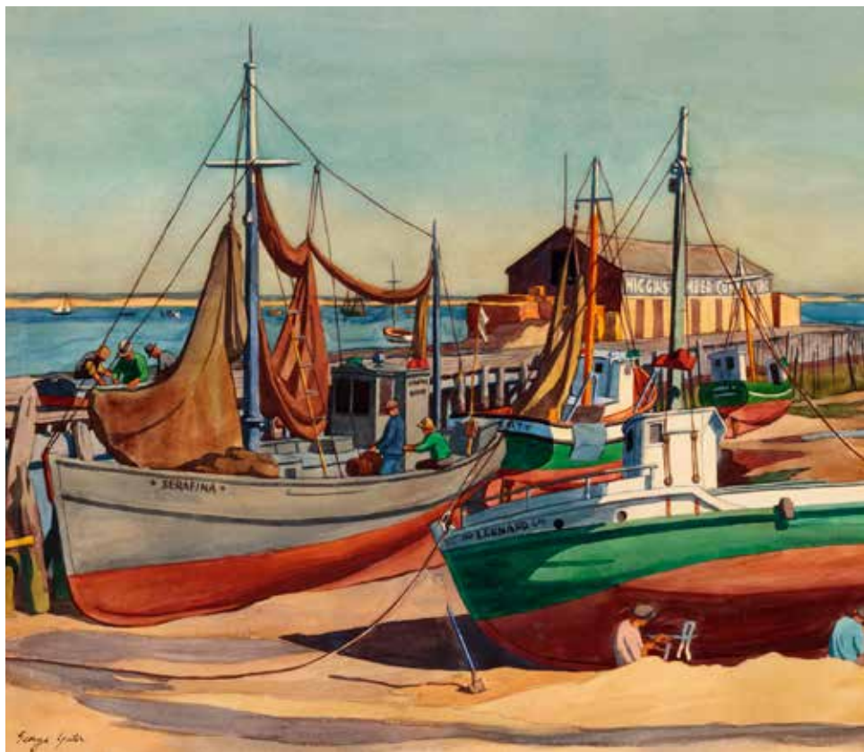
Detail from Boats at Higgins Wharf by George Yater