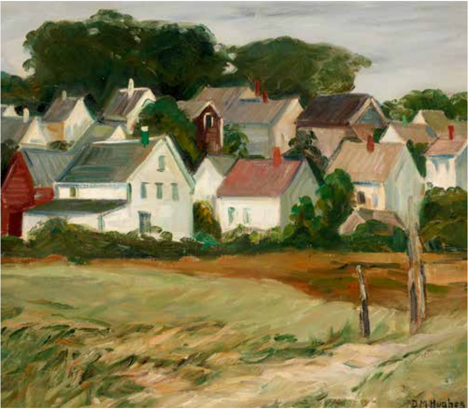
Detail from Summer Landscape by Daisy Marguerite Hughes