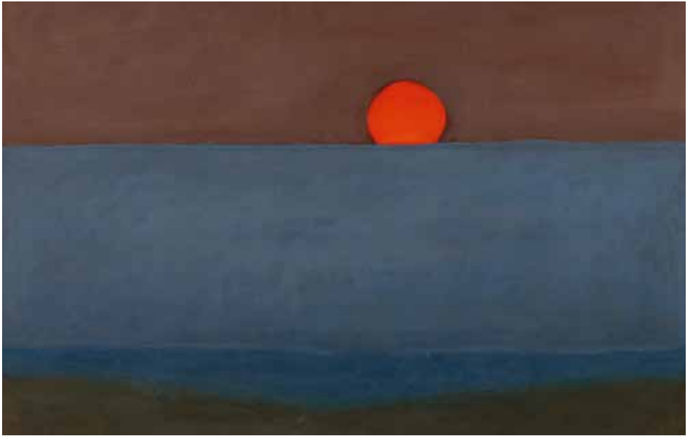
Detail from Smoke by Peter Watts