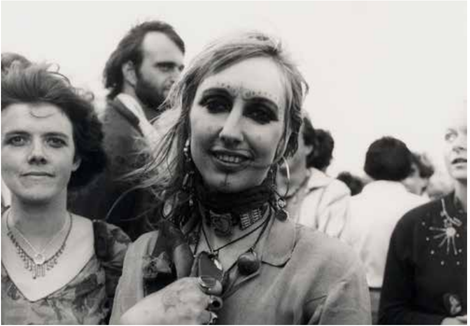
Detail from Caroline at Land's End Inn, Provincetown by David Armstrong

The permanent collection is an important measure of any museum's value. At PAAM, the holdings of local and regional art is extensive and dynamic, comprising nearly 4,000 works by over 700 Twentieth Century and contemporary artists who have worked in Provincetown and on Cape Cod. Their styles were revolutionary and remain noteworthy in the history of American Art. The PAAM Collection weaves together at least three major art movements—each a significant strand of American art history—and creates perspectives that uniquely position the Provincetown Art Colony as a pertinent fixture to the larger art world.