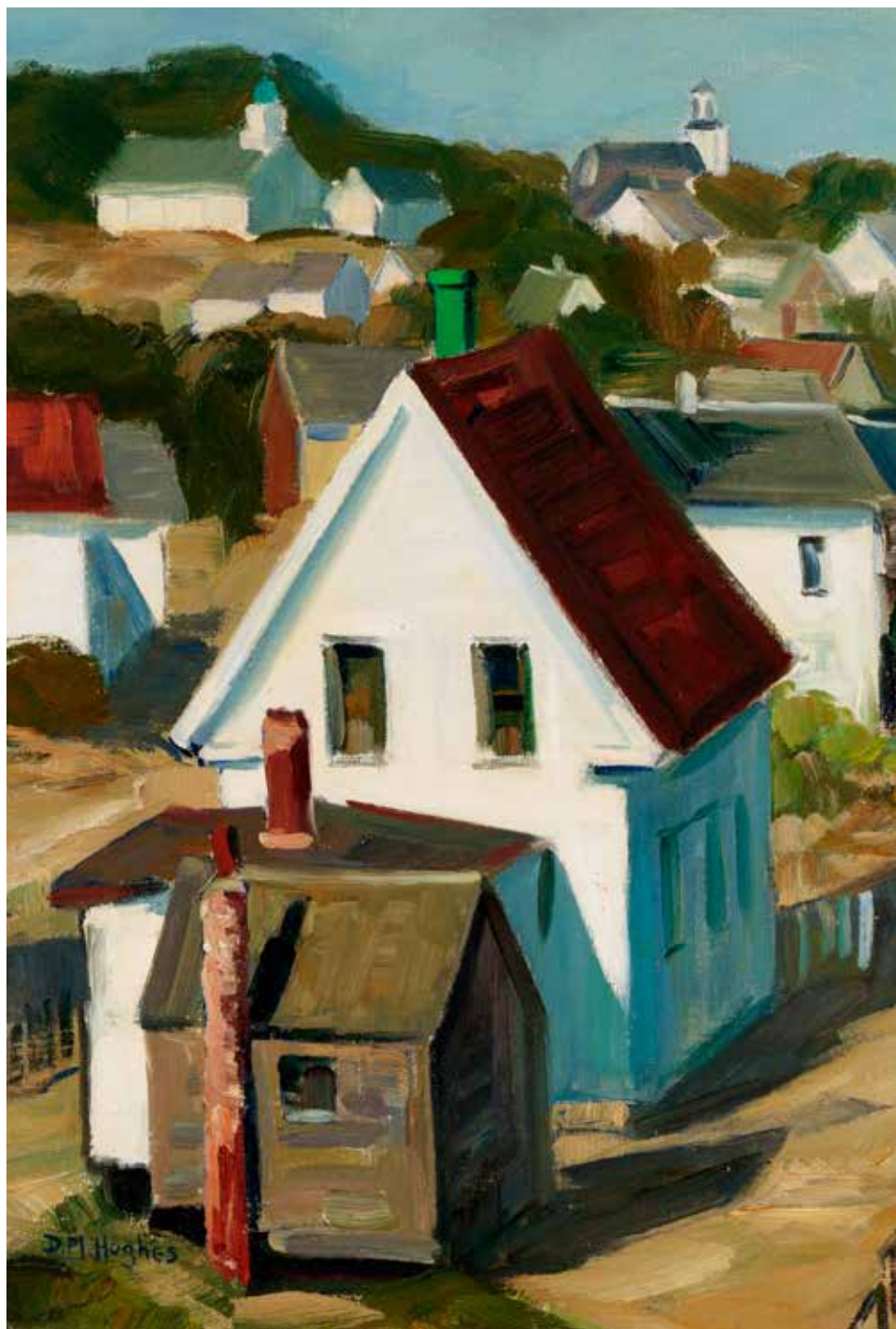
Detail from Houses by Daisy Hughes