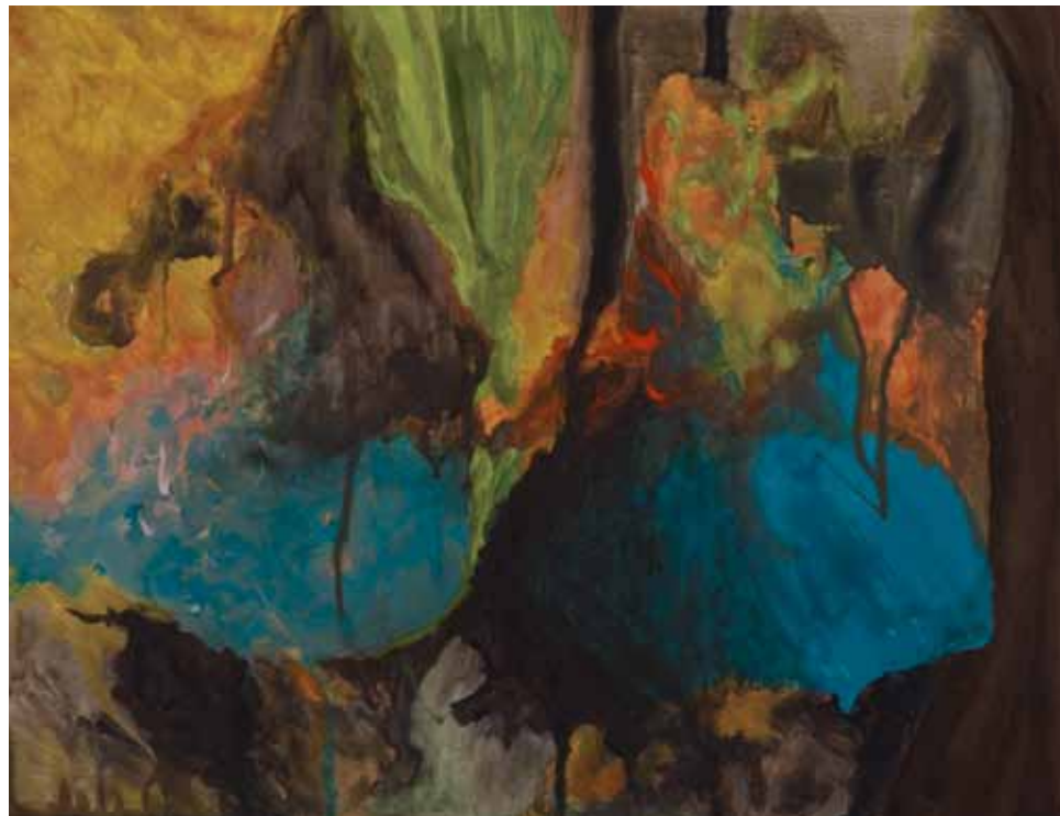
Natures Dance , acrylic, latex and oil on wood panel, 20" x 24", 2010