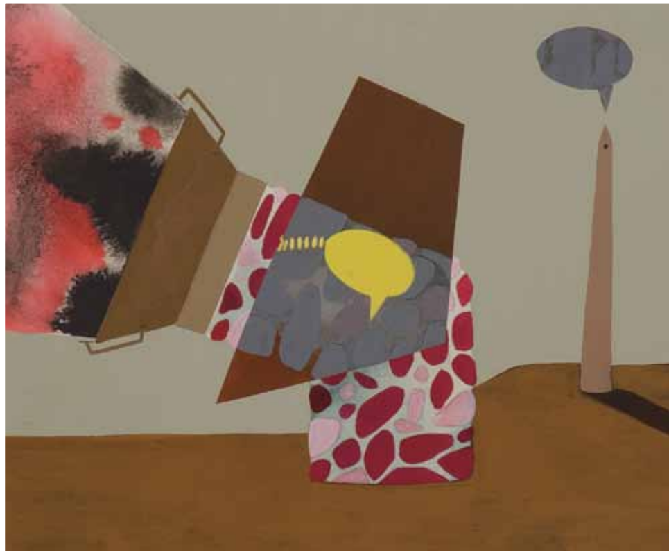
Light and Spaceship , collage on paper, 8" x 10", 2010