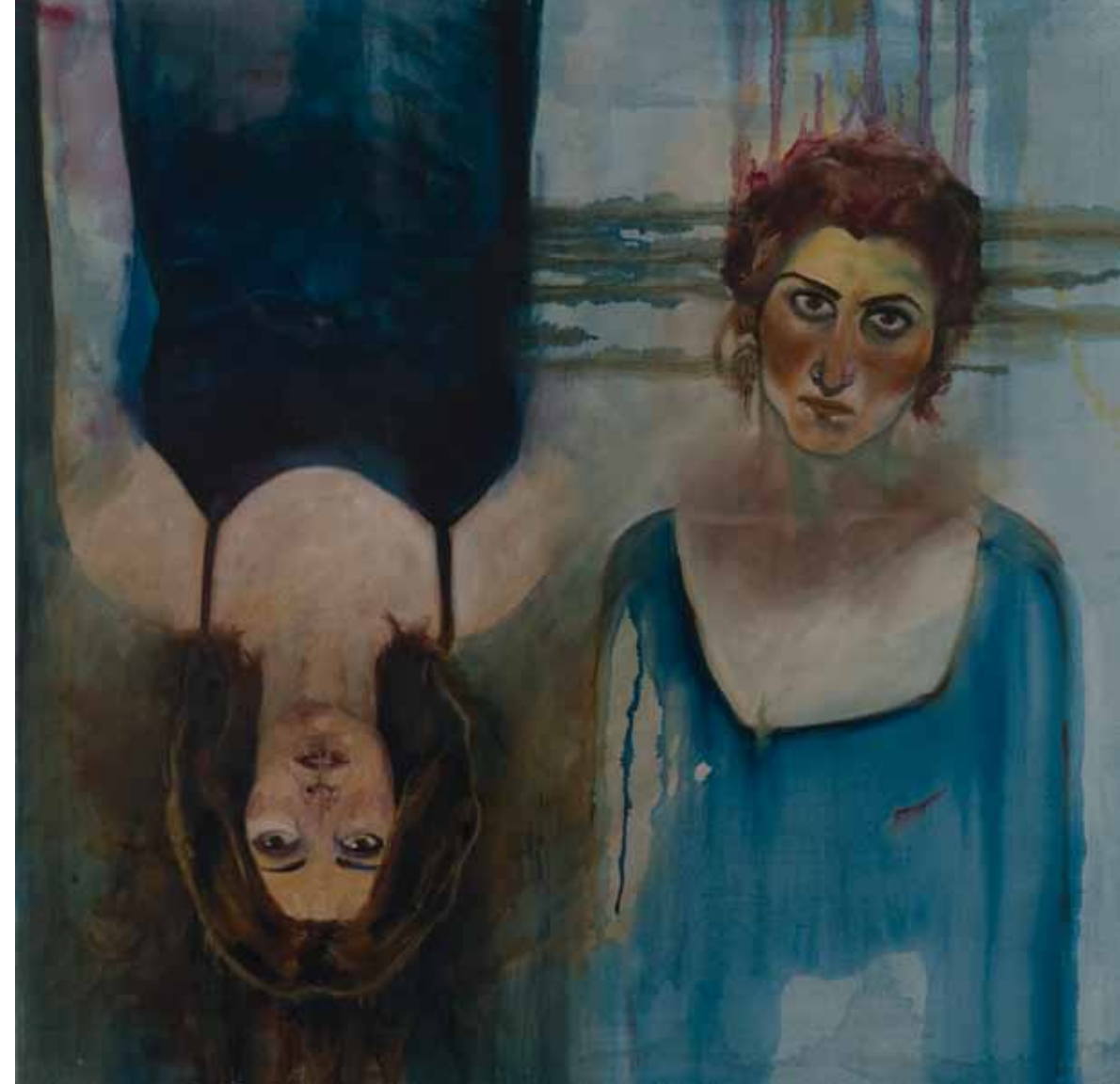
Ich Tu Dir Weh oil on canvas 36" x 36" 2010

A collection of thoughts and moments, a reaction to an action that took place the very moment I entered the studio or a million years ago when I was dreaming. An introspective collection of paintings, that reflects at times, my Italian heritage. Only oils (I am, after all, a purist) on different surfaces (wood, canvas, paper), satiate me. Skin and abstract spaces, blue and sienna, distortions and penumbra.