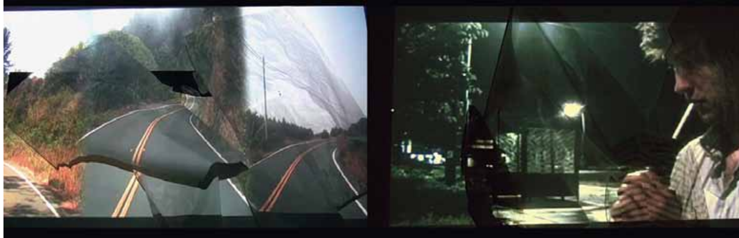
Still from in the end , HD video, 5 minutes and 18 seconds, 2009

Everything I create comes from a personal story or experience. I believe in the network of personal accounts told from person to person and the power, mystery and insight these stories can hold. My work takes the form of visual documentary films that portray gritty male characters who depart from the traditional ideals of masculinity.