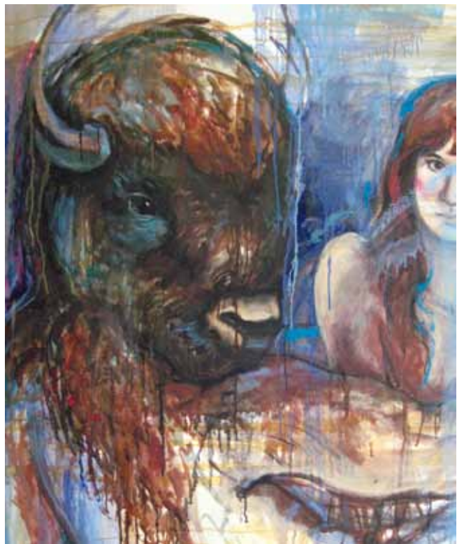
George's Minoloaf Enjoys Some We Time (detail) oil on Canvas 66" x 84" 2010