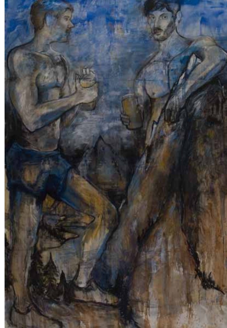
Titans on Break oil on canvas 84" x 66" 2010

I am intrigued by the notion of "mortalizing" and normalizing mythological creatures that are historically locked in epic and dramatic allegory and legend. It is my contention that the gods can't be engaging in battle or supernatural activities all the time. So I paint their downtime as anti-climactic accounts of the in-between.