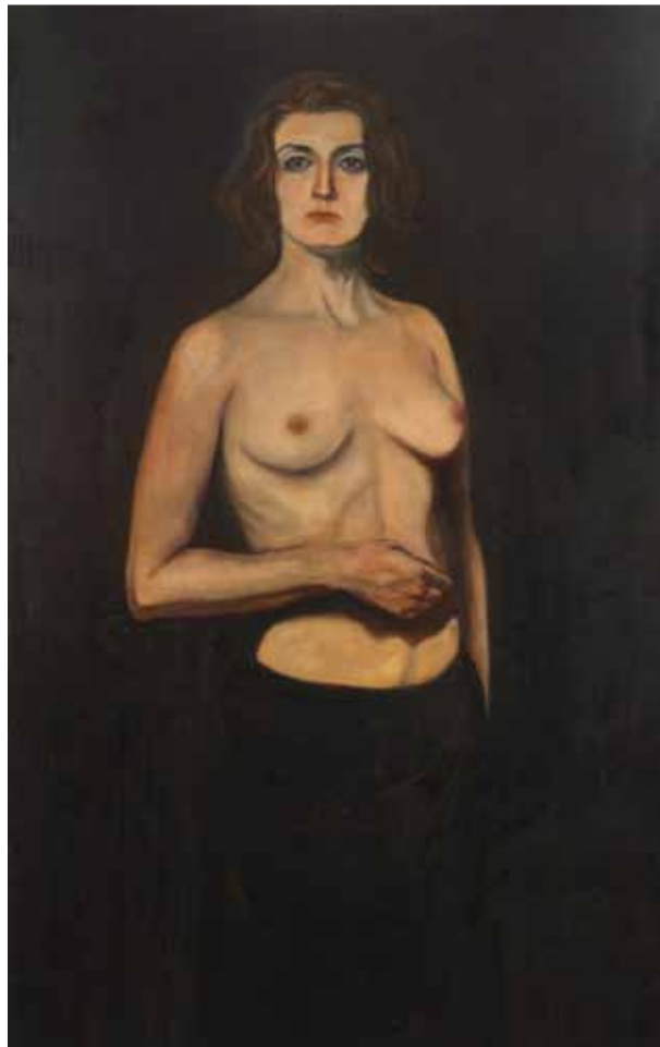
Fantasma di Vita Passata oil on canvas 58" x 36" 2010

“Mirror, mirror, on the wall, who’s the scariest of them all?”