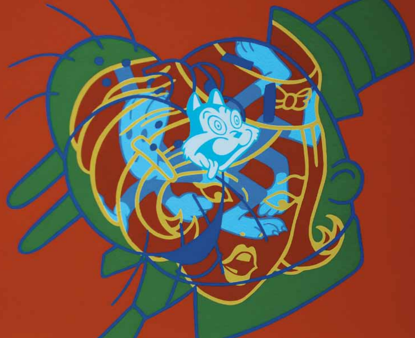
opposite: Headlock: Daphne - Porky - Slaughter Lamb acrylic on canvas 18" x 24" 2009