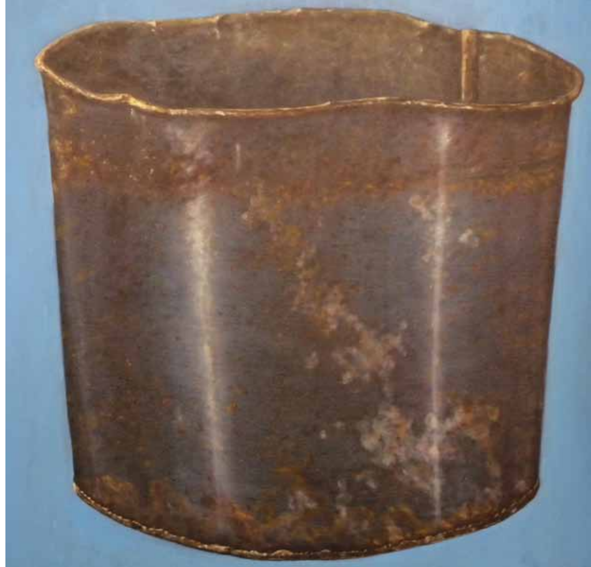
Don't Kick the Bucket, oil on canvas 36" x 36" 2009

My latest paintings feature common objects that are used, rusty, or broken, which are made with the hope that people see beauty in the old and discarded. Objects are often presented alone on a canvas, drawing the viewer's attention to what they might otherwise overlook. My inspiration for these paintings comes from the day-to-day experiences in my life. Something may happen one day and end up in a painting the next.