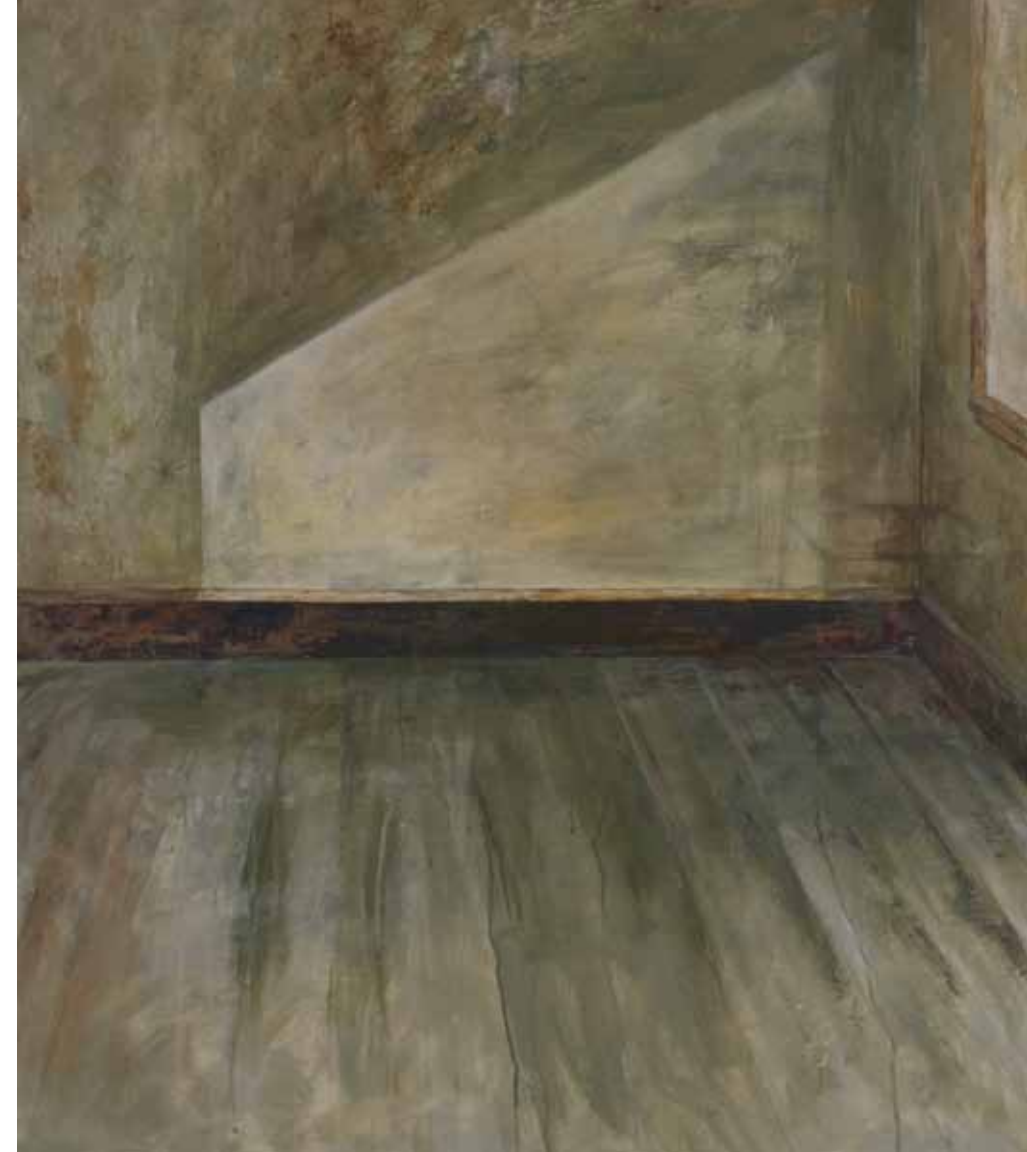
Ephemeral Place mixed media oil 42" x 36" 2010

Witnessing a stately home, still loaded with remnants and memorabilia from the previous owners, being crushed and gutted before my eyes was an inspiration for this series of work. This was not a neglected home, but simply outdated. Surfaces reflecting layers of the past, much like the layers of wallpaper or paint, and what is buried beneath are what evoke the subject of my investigation. While I explore abandoned and demolished structures as an inspiration for my work, my own memories unfold involuntarily, layer by layer, during the painting process. My interest is not in the literal pictorial translation of the spaces I create, but in the abstracted memory of the space in which the memories were created. The purpose of this series of work, which evokes ambiguity, is to provide an impetus for the viewer to contemplate his or her own memories.