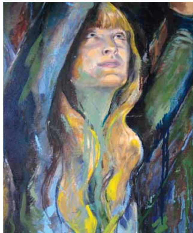
A Midsummer Night's Drink (detail) oil on Canvas 84" x 66" 2010

I am intrigued by the notion of "mortalizing" and normalizing mythological creatures that are historically locked in epic and dramatic allegory and legend. It is my contention that the gods can't be engaging in battle or supernatural activities all the time. So I paint their downtime as anti-climactic accounts of the in-between.