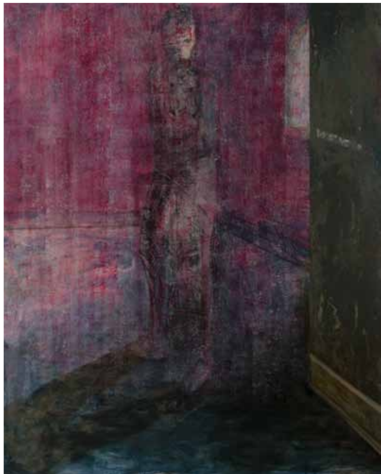
Ourself Behind Ourself Concealed , oil on panel, 61" x 48", 2010

Exploring memories and the physical space from where they originate is the catalyst for my work. Experiences are ephemeral and fade into memories over time. Memories like the physical space in which they were created, erode with time. I am intrigued by the connection humans have to space and time and the fragility that exists between them.