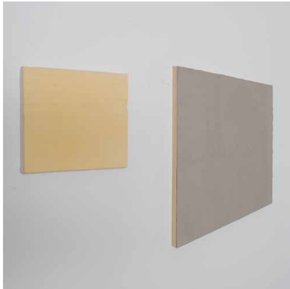
Slip , distemper on panel, 11" x 17" (diptych), 2010