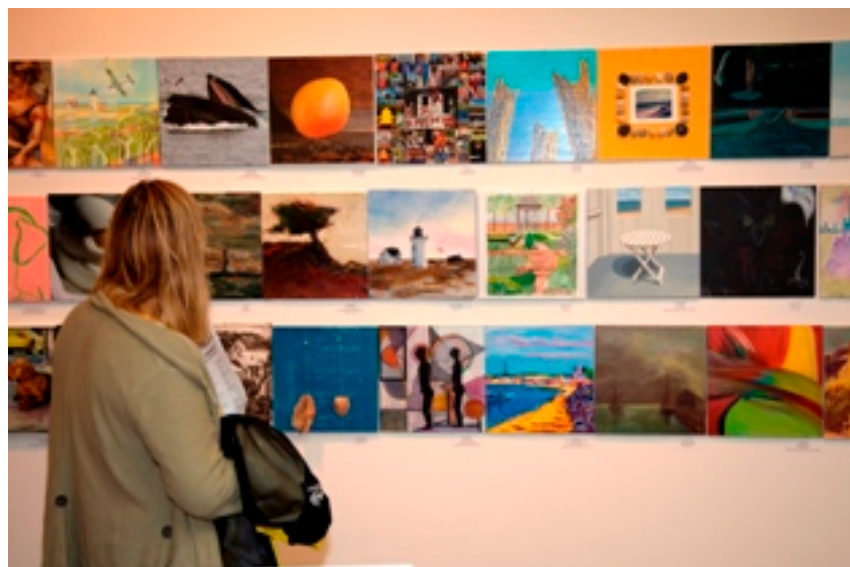
Visitor viewing artwork hanging in the Members' 12x12 Exhibition and Silent Auction at PAAM