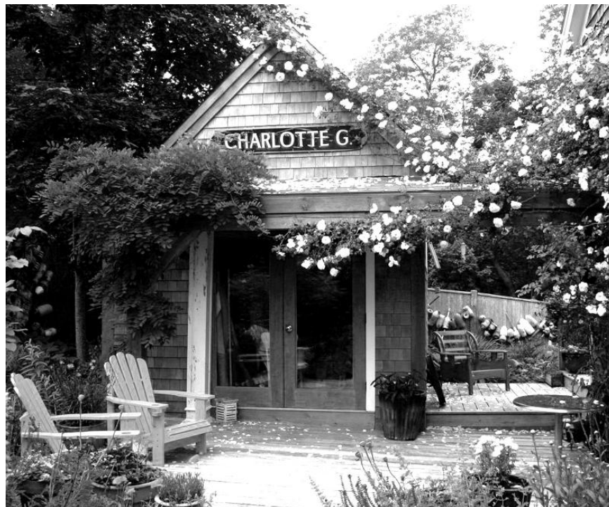
PAAM's 14th Annual Secret Garden Tour