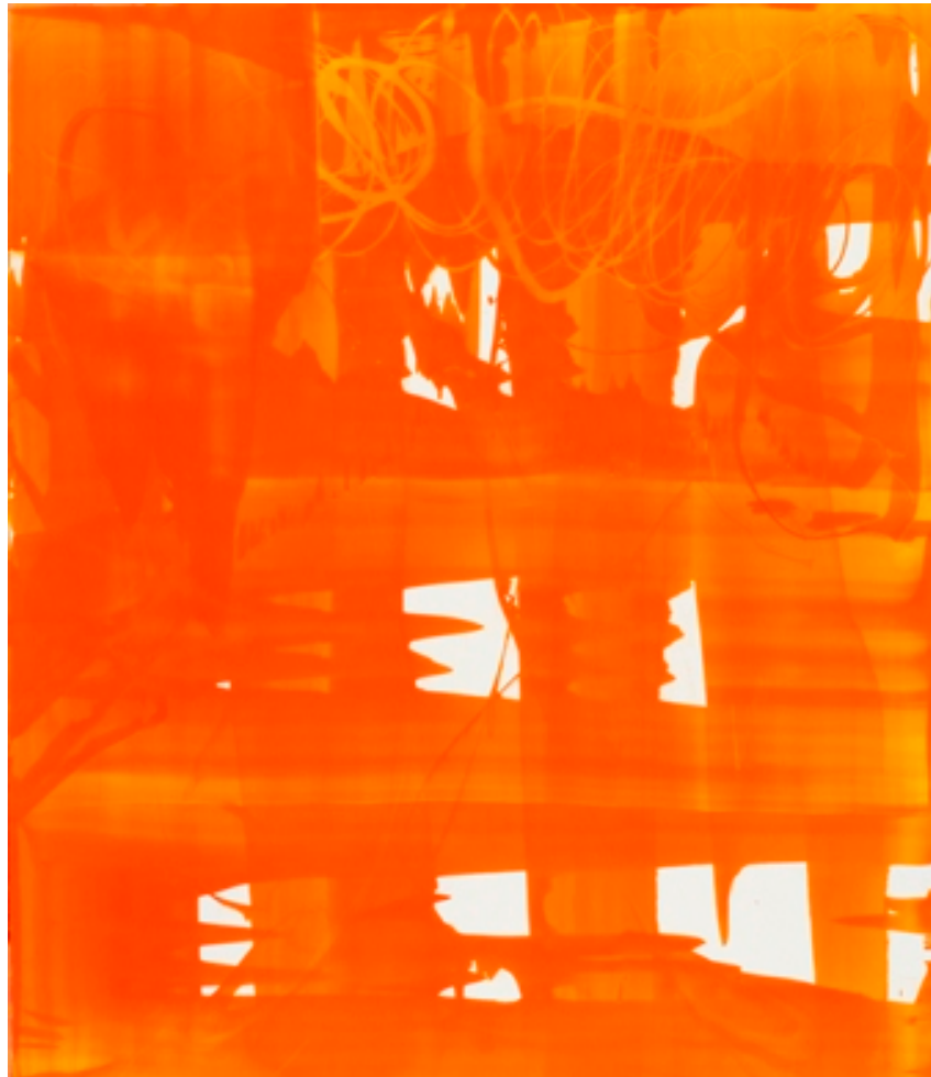
Bernd Haussmann, #2137, from the Mountains and Oceans Series, 56.5x48, oil on aluminum, 2011