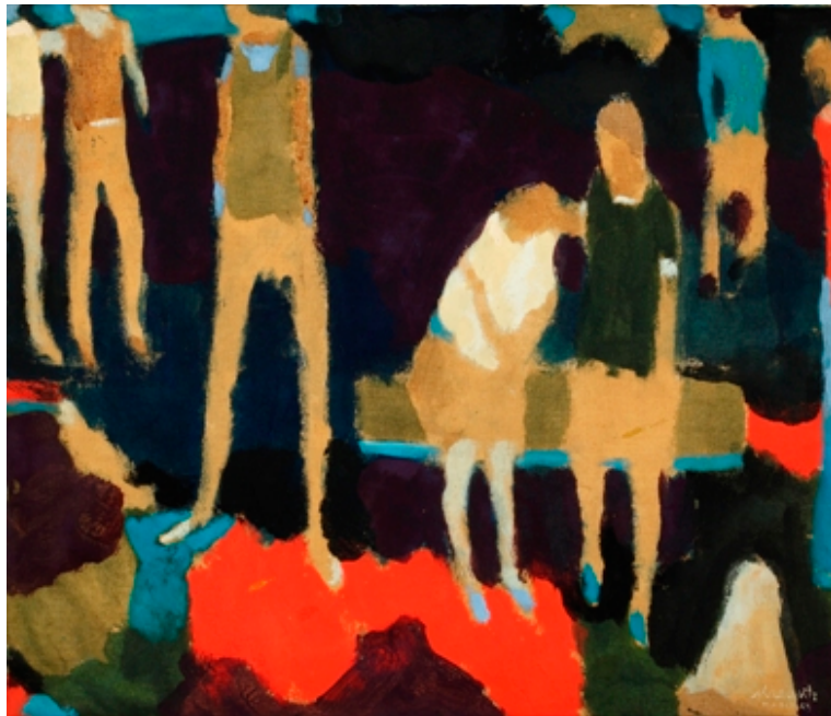
Irving Marantz, The Park. Available at PAAM's Spring Consignment Auction