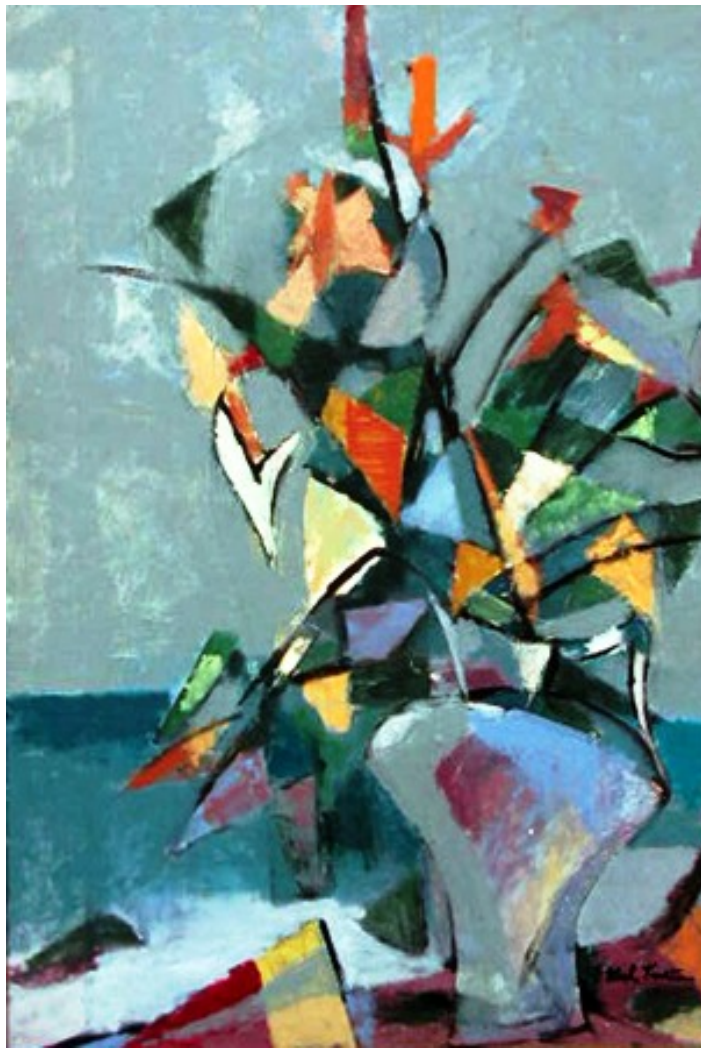
Karl Knaths, Flowers in Vase, PAAM Collection