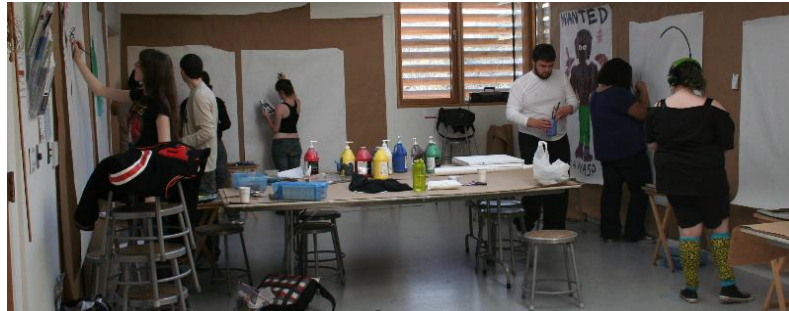
Art Reach participants