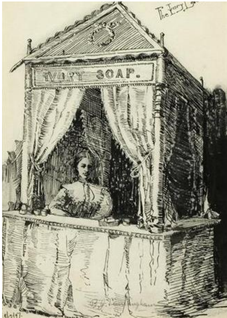
Edward Hopper, The Ivory Booth

creative process. PAAM, located at 460 Commercial Street, is open (October - May) noon to 5pm, Thursday, Friday, Saturday and Sunday, also open by appointment; (Memorial Day - September) 11 am - 8pm Monday - Thursday, 11am - 10pm Friday, 11am - 5pm Saturday and Sunday. General admission $7. Free to members and children 12 and under. For more information, please call 508.487.1750 or visit www.paam.org .