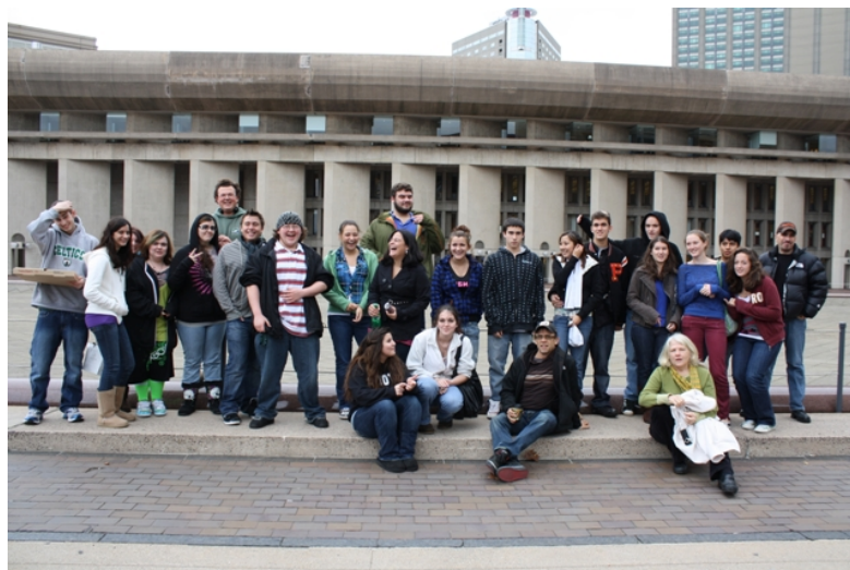
Student Participants from Provincetown High School