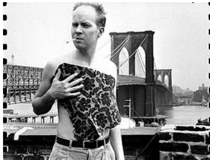
image: film still from How to Draw a Bunny , screening in Provincetown at PAAM Thursday, March 18, 2010 at 6:30pm.