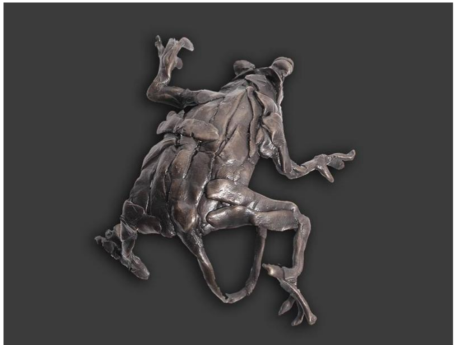
image: Anna Poor, Shredded Rat Skin, unique bronze, 2008, 3.5"x4"x3"

For painters who are interested in distancing themselves from reality and direct interpretation of subjects, this workshop will explore abstraction, while maintaining a sense of objectivity. An emphasis will be placed on changing the way one sees through painting and using the medium to transform reality. Students will be encouraged to bring in reference material