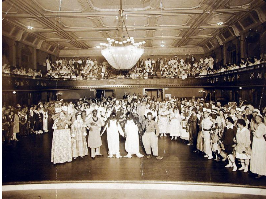
Photo of an early costume ball at the Town Hall, used as a reference for Town Hall renovations

IMMEDIATE RELEASE October 2011 Media Contact Annie Longley alongley@paam.org (508) 487.1750