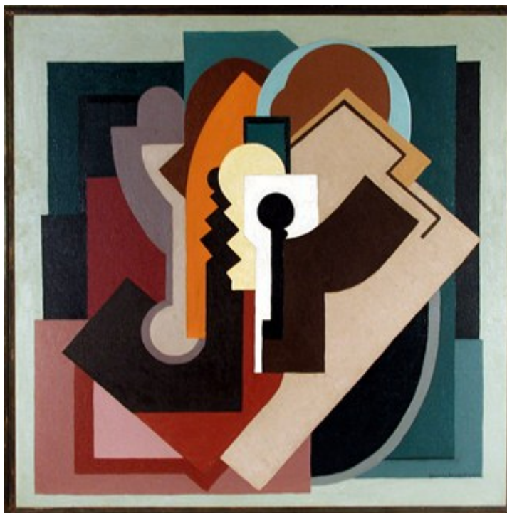
Blanche Lazzell, featured in the PAAM's upcoming Highlights from the Permanent Collection exhibition

IMMEDIATE RELEASE October 2011 Media Contact Annie Longley alongley@paam.org (508) 487.1750