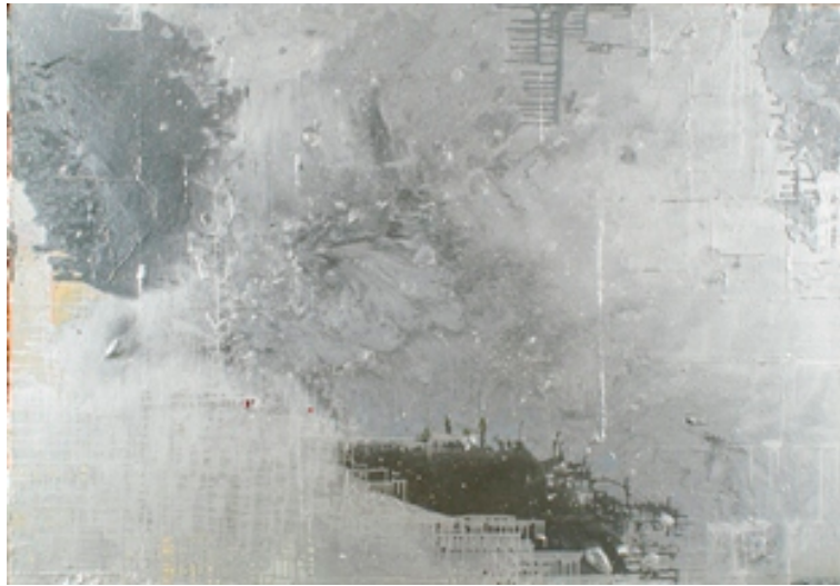
#896, Bernd Haussmann, from the Mountains and Oceans Series, 48x70, oil and mixed media on canvas, 2011