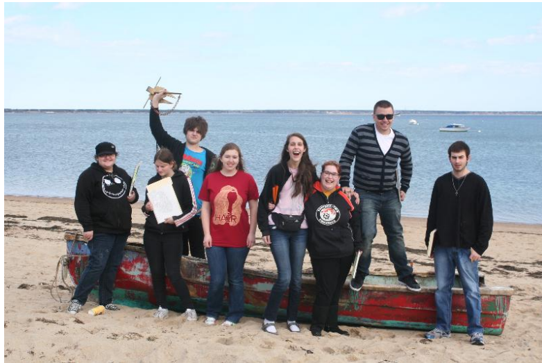
Art Reach students on the beach

IMMEDIATE RELEASE July 2011 Media Contact Lynn Stanley lstanley@paam.org (508) 487.1750, Ext. 13