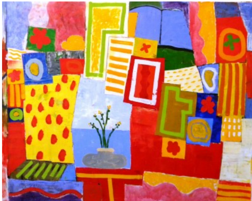
Bill Barrell, Open Window with Flowers