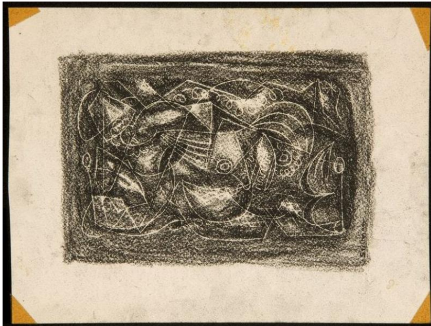
Ary Stillman, Priscilla No. 4 , 1948, embossing and charcoal on paper, 12 x 9.25", gift of The Stillman-Lack Foundation