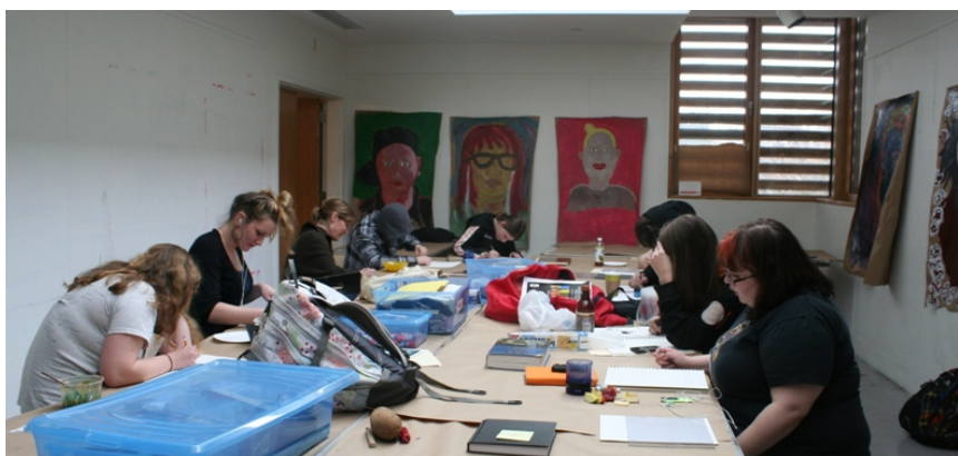
Students of Art Reach working in PAAM studio