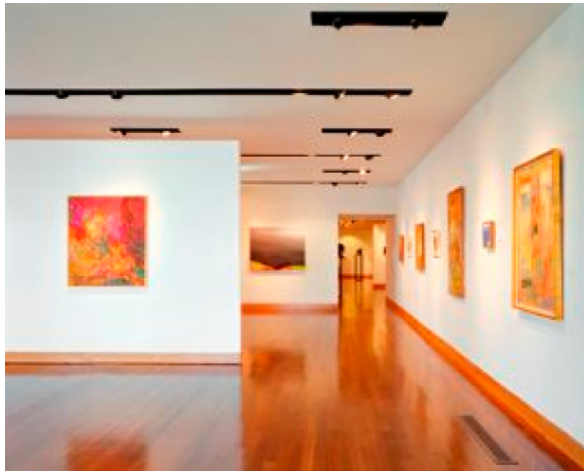
Patrons Gallery at PAAM