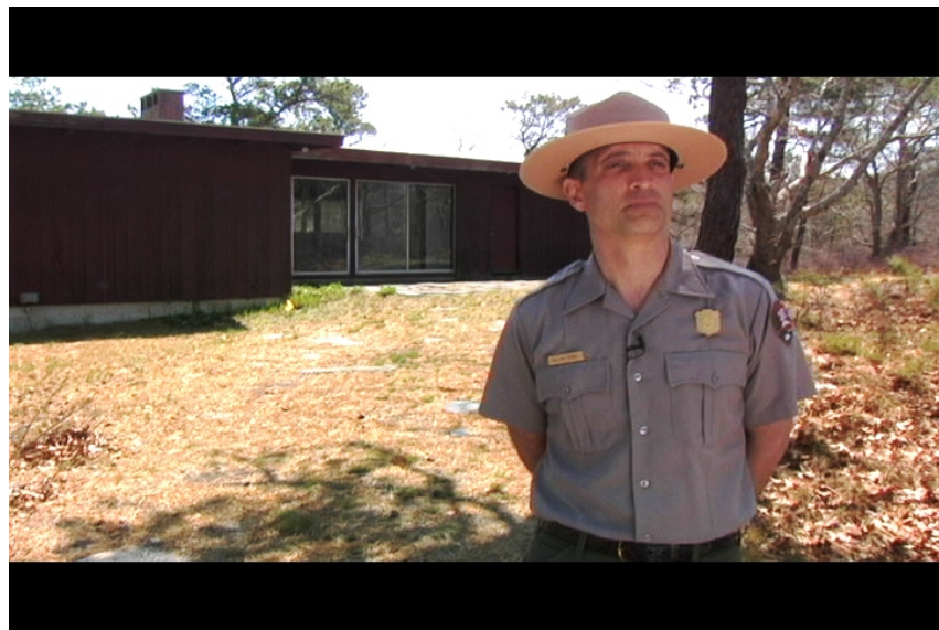
Film still from Spectral Houses