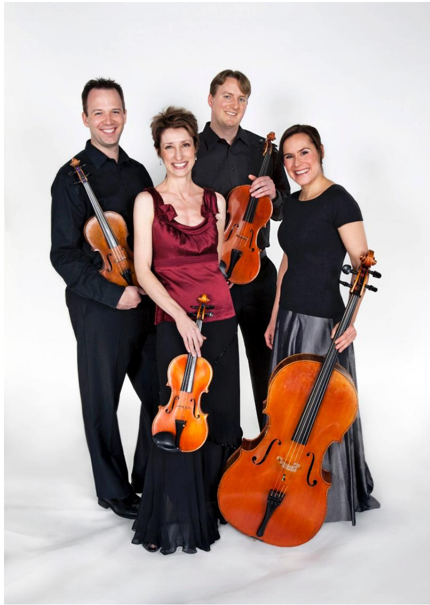
Fry Street Quartet