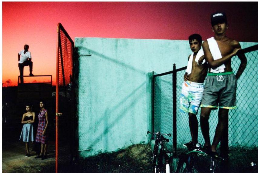
Alex Webb, Sancti Spiritus, Cuba, 1993, digital C print photograph, 20 x 30"