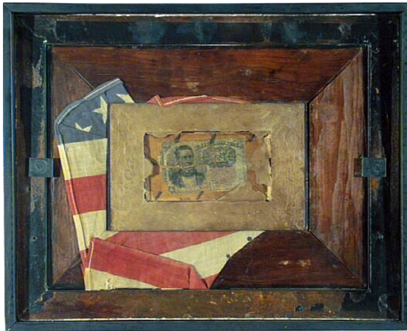
Varujan Boghosian, untitled, mixed media construction, PAAM Collection

Immediate Release September 14, 2010 Media Contact Chris McCarthy cmccarthy@paam.org 508.487.1750 x10