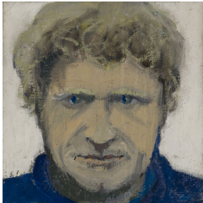
Portrait @ 30 (self) oil on canvas, 14 x 14"