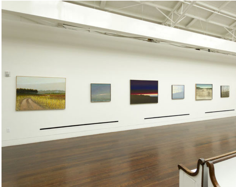
Out to Sea , 2009 oil on canvas, 38 x 40"