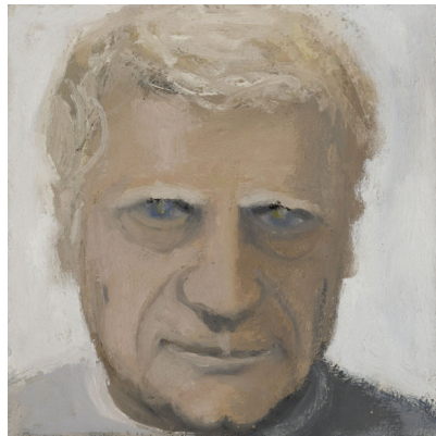
Portrait @ 50 (self) oil on canvas, 14 x 14"