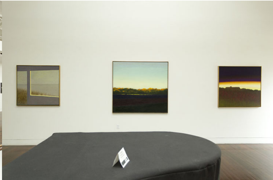
Three Ponds , 2009 oil on canvas, 24 x 26"